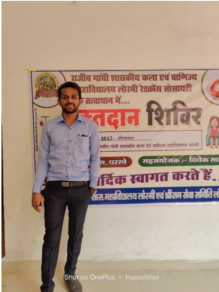
Shot on OnePlus × Hasselblad