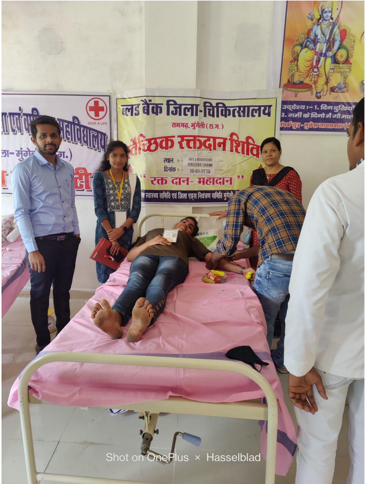
Shot on OnePlus × Hasselblad